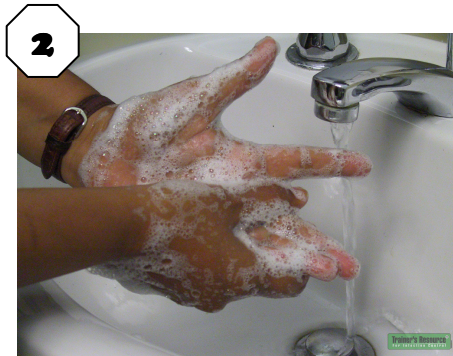
2 Rub hands together to make lather and scrub for 15-20 seconds

With either method, be sure to cover all surfaces of the hands and fingers including: ▪ Under your nails ▪ Around your wrists ▪ In between your fingers