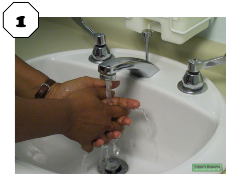
1 Wet your hands with clean running water and apply soap