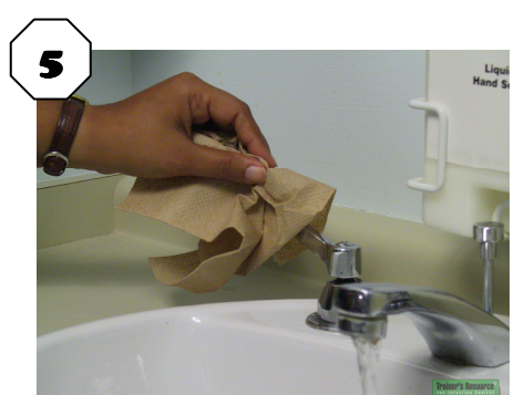
5 Use your paper towel to turn off the faucet and open bathroom door