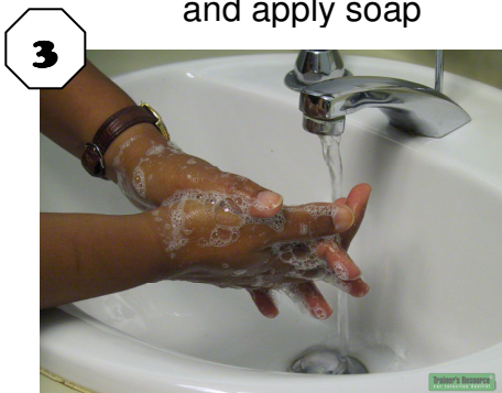
3 Rinse hands well under running water

With either method, be sure to cover all surfaces of the hands and fingers including: ▪ Under your nails ▪ Around your wrists ▪ In between your fingers